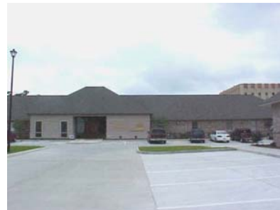
Main Office Building in the Celtic Centre Complex

Along with these three buildings, The Celtic Centre will be comprised of several more new buildings to be constructed in the future for long term lease to commercial businesses.